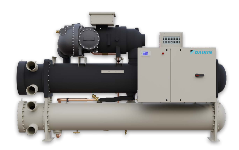
CHART A CONFIDENT COURSE TOWARD HIGHER EFFICIENCIES

In a world where no two buildings are identical and each day brings unique climate conditions, we've crafted an HVAC solution that embraces adaptability and efficiency. Utilizing the cutting-edge water-cooled screw technology, the Navigator is engineered as a fully Variable Frequency Drive (VFD)-driven platform, engineered to seamlessly adapt to any building's unique needs, day or hour.